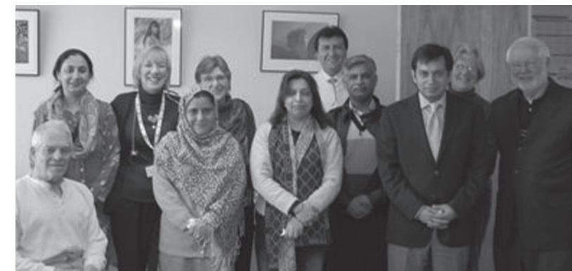
A delegation of health specialists came to visit us from Pakistan.